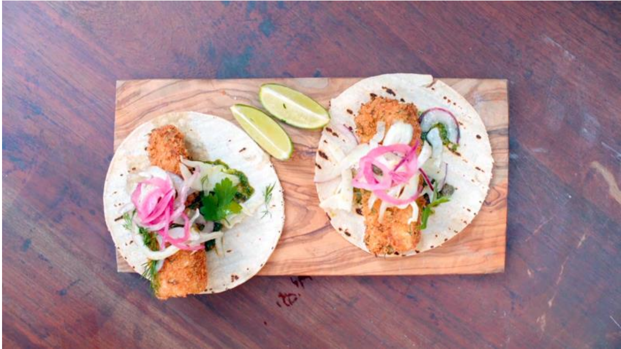
Our Baha fish tacos with fennel and caper slaw

The below questions are intended to give us an indication of the wider impact of presenting at a YFN event on your project. Don't worry about giving exact figures – an estimation will do.