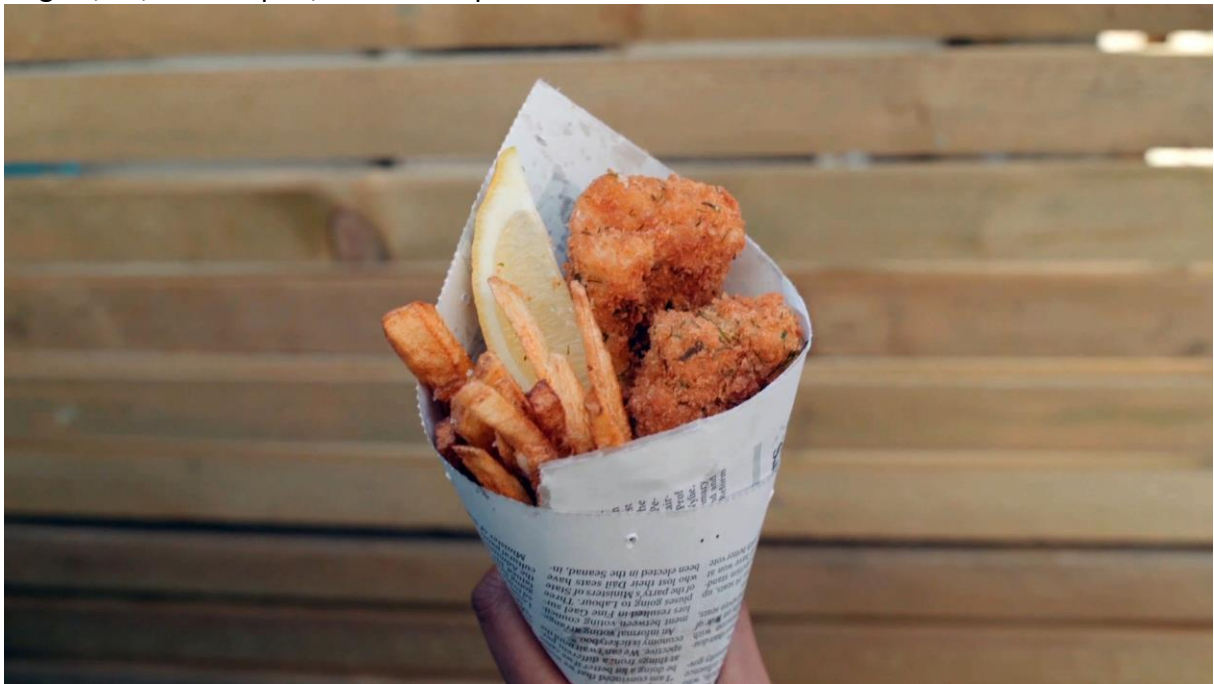
Our panko-fried coley with skin-on chips